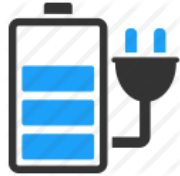
INBUILT BATTERY BACKUP