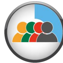
EMPLOYEE/ CUSTOMER MANAGEMENT AND REPORTING