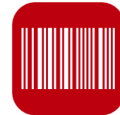
BARCODE SCANNER SUPPORT