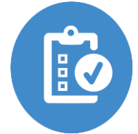
INVENTORY AND ACCOUNT MANAGEMENT